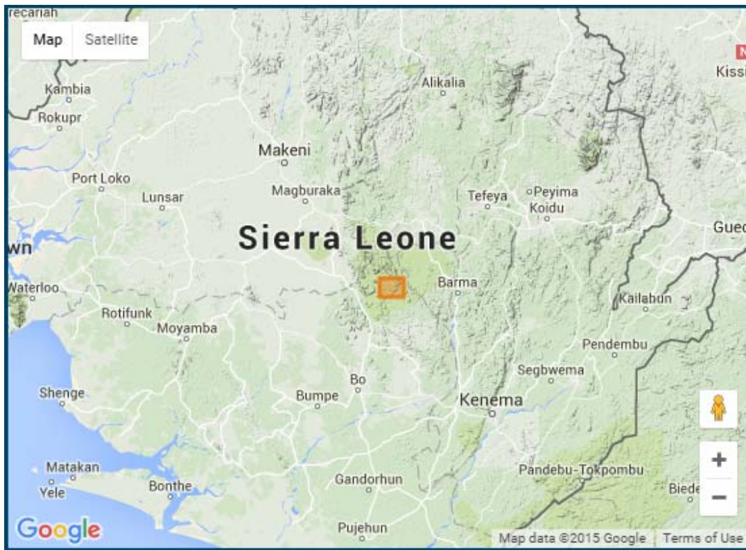
Figure 1: The location of area is Valunia Chiefdom Bo dist (large scale)